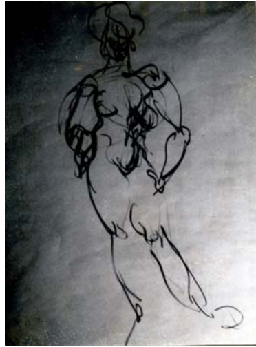
1969, Art Students League, live drawing