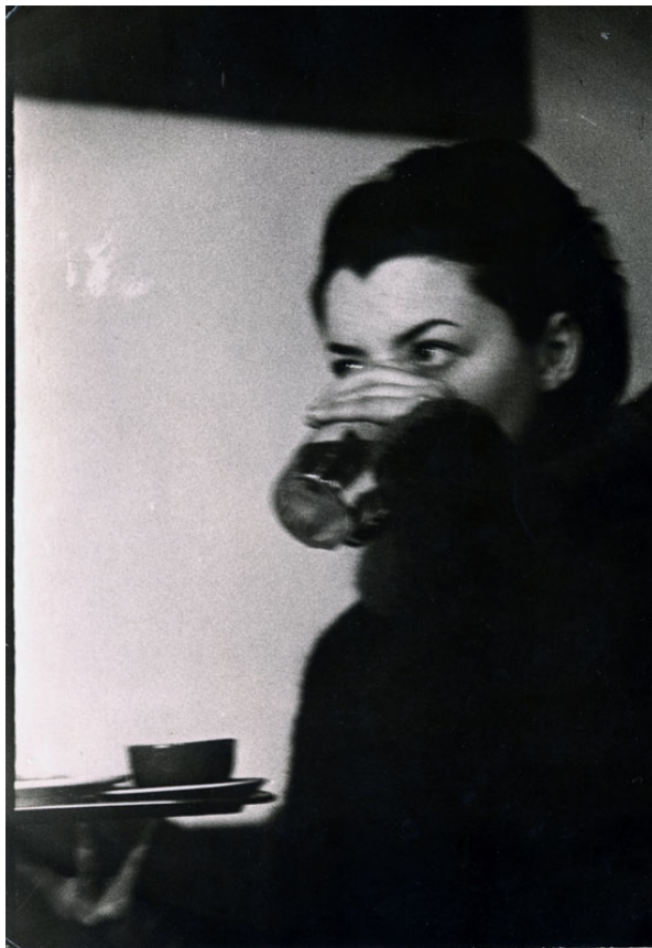
1961, AT in Vienna