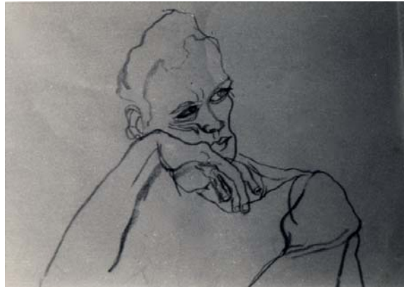
1969, Art Students League, live drawing