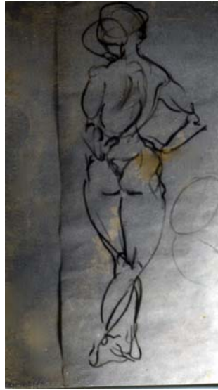
1969, Art Students League, live drawing