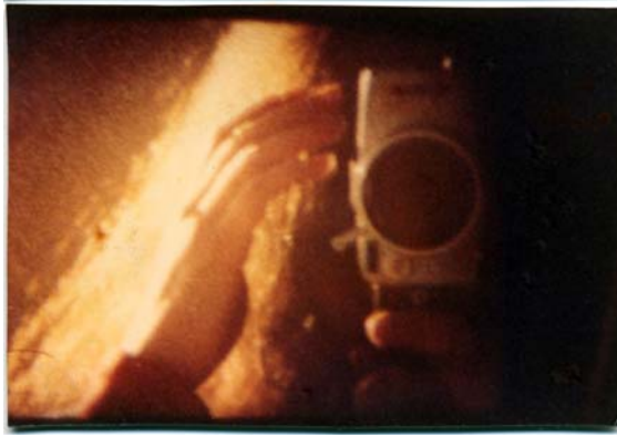
1971, New York, with super-8 film camera