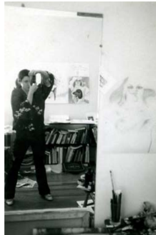
1969, apartment at 445 East 77 th Street, NY