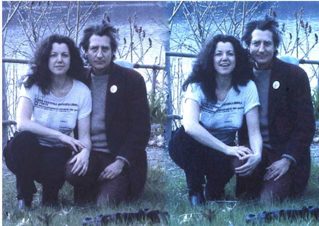
With Jackson Mac Low, at Rheinbeck, 1980