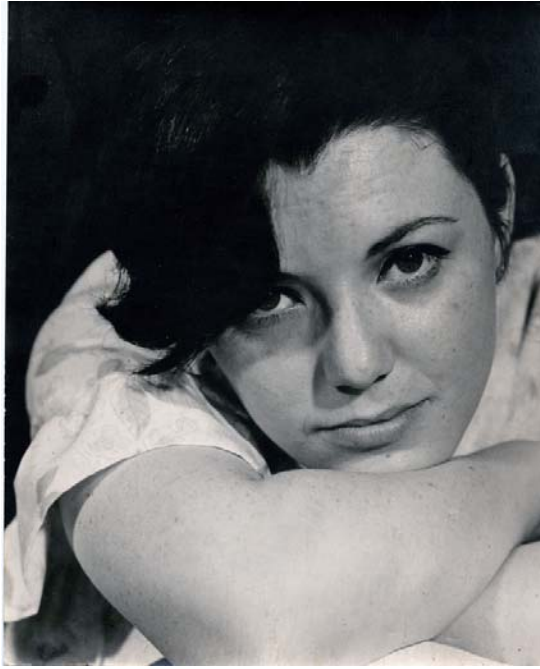
1966, AT in New York